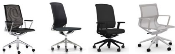
VITRA chair (Meda, Meda Pro, AM chair, Physix)