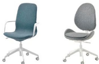
IKEA chair (LÅNGFJÄLL, HATTEFJÄLL)