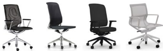
VITRA chair (Meda, Meda Pro, AM chair, Physix)