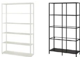
IKEA rack (FJÄLKINGE, VITTSJÖ)

CZK 500 / 1 pcs / month Fjalkinge rack 118 x 193 cm VITTSJO rack 100 x 175 cm