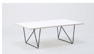
MASTER&MASTER table Flat Diamond