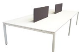
VITRA Workit table