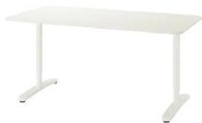
IKEA BEKANT table