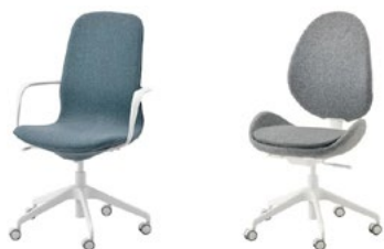
IKEA chair (LÅNGFJÄLL, HATTEFJÄLL)